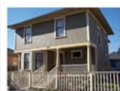
American Foursquare (1904) 419 Daisy Avenue