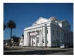
Renaissance Revival (1924) 655 Ceader Avenue