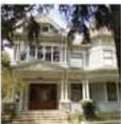
Bembridge House (1906) 953 Park Circle Drive Late Victorian