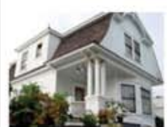
Flossie Lewis House (1905) 628 W. 10th Street